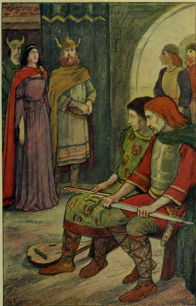
HAGEN AND VOLKER IN THE PRESENCE OF KRIEMHILD.